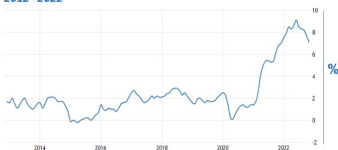
Ten Year History of U.S. Inflation Rate 2012 - 2022

Source: Tradingeconomics.com / U.S. Bureau of Labor Statistics