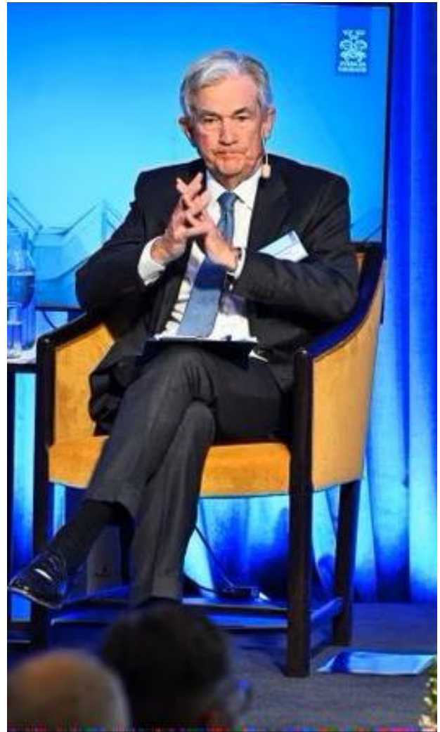
Jerome Powell, chairman of the US Federal Reserve

Even with the possibility of a recession on the horizon, the Fed's still stand by their goal of a 2% inflation target. Chair Jerome Powell stated, "the largest amount of pain, the worst pain, would come from a failure to raise rates high enough and from us allowing inflation to become entrenched." (Source:reuters.com, 12/14/22)